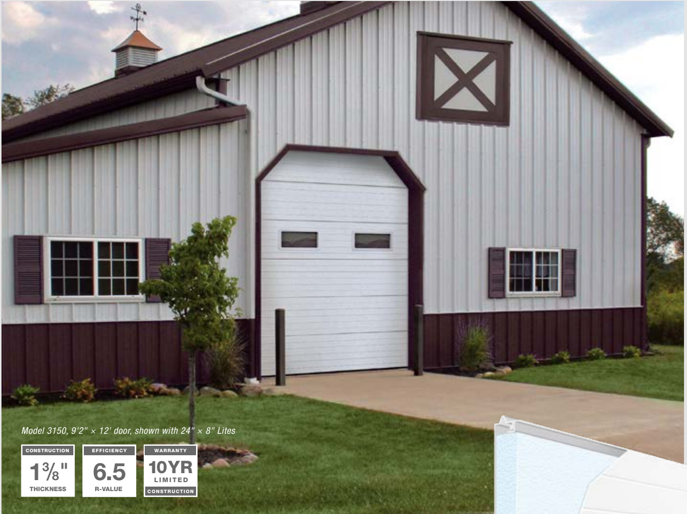
Model 3150, 9'2" x 12' door, shown with 24" x 8" Lites