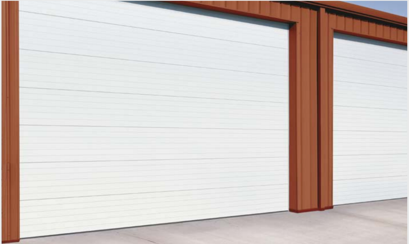
Model 3715, 14'2" x 14" doors