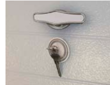
Outside keyed lock