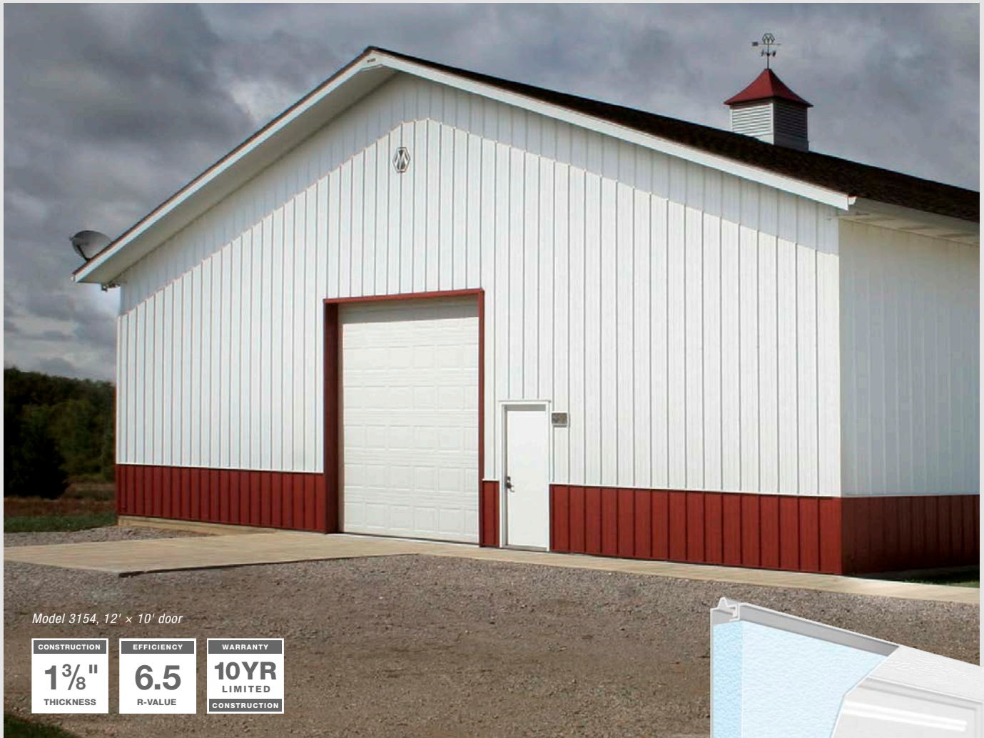
Model 3154, 12' x 10' door