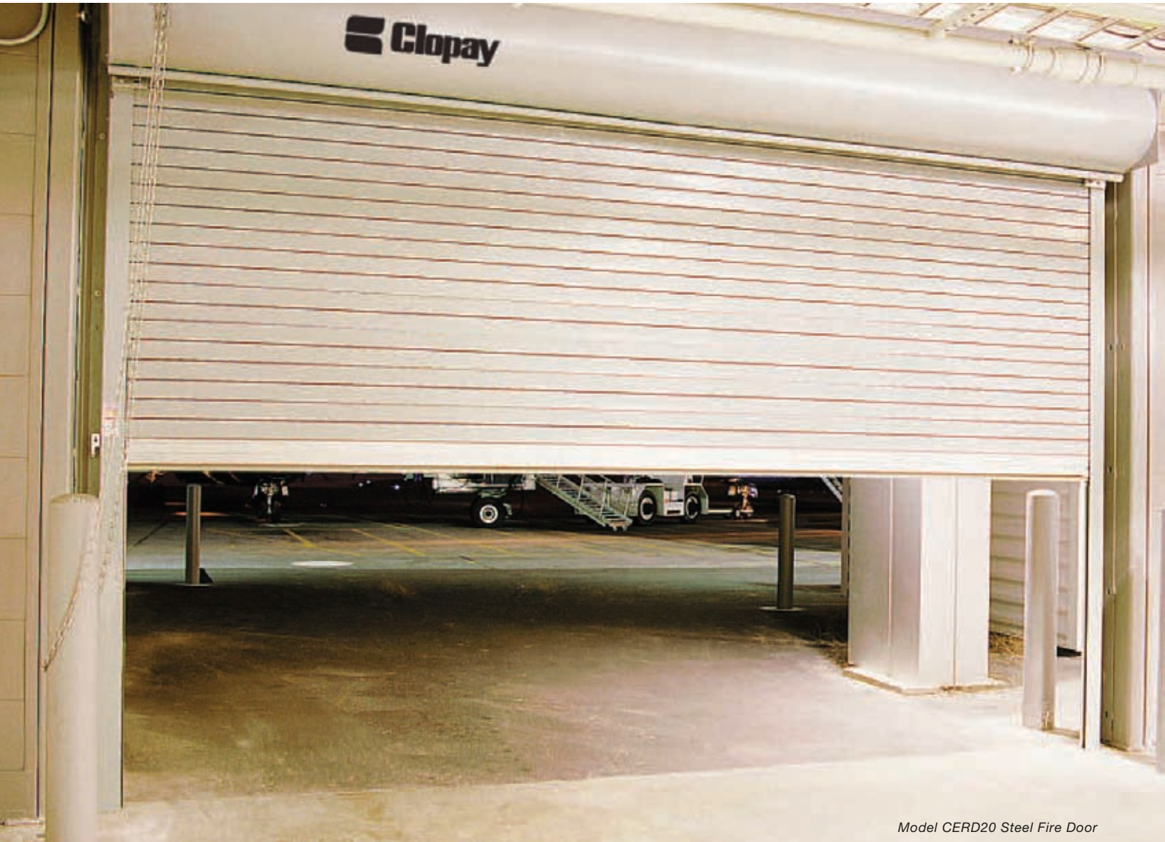
Model CERD20 Steel Fire Door