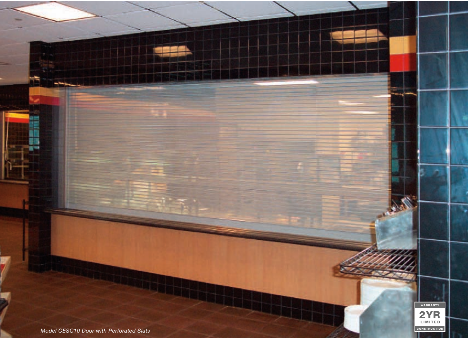
Model CESC10 Door with Perforated Slats