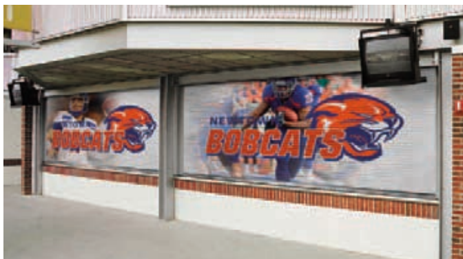
Model CESC10 Door with Graphics