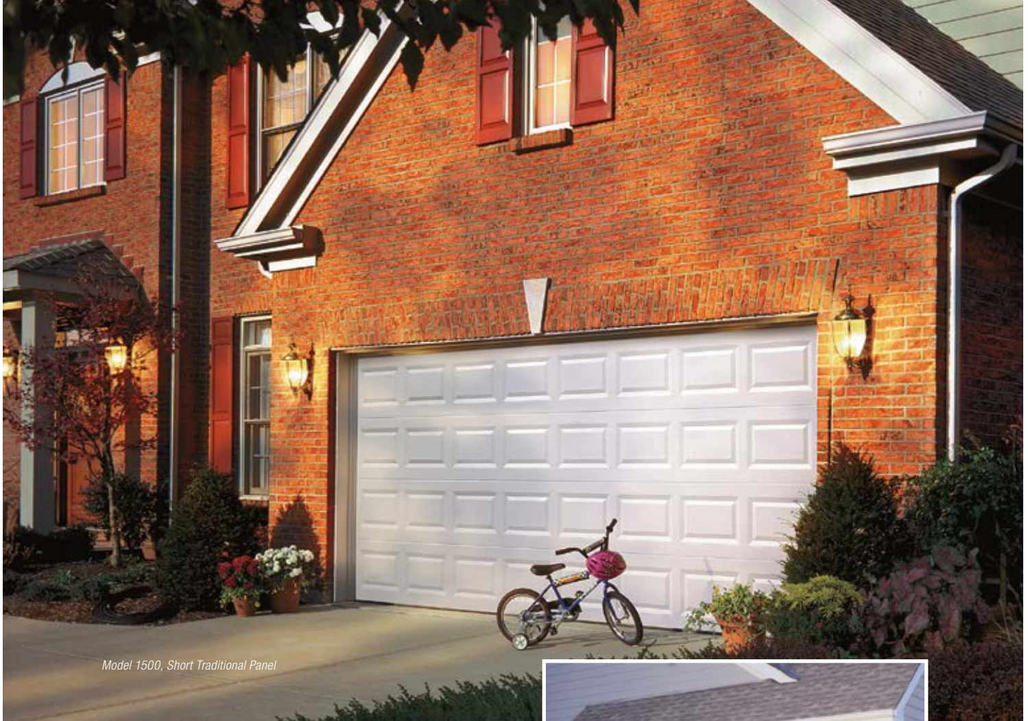
Model 1500, Short Traditional Panel