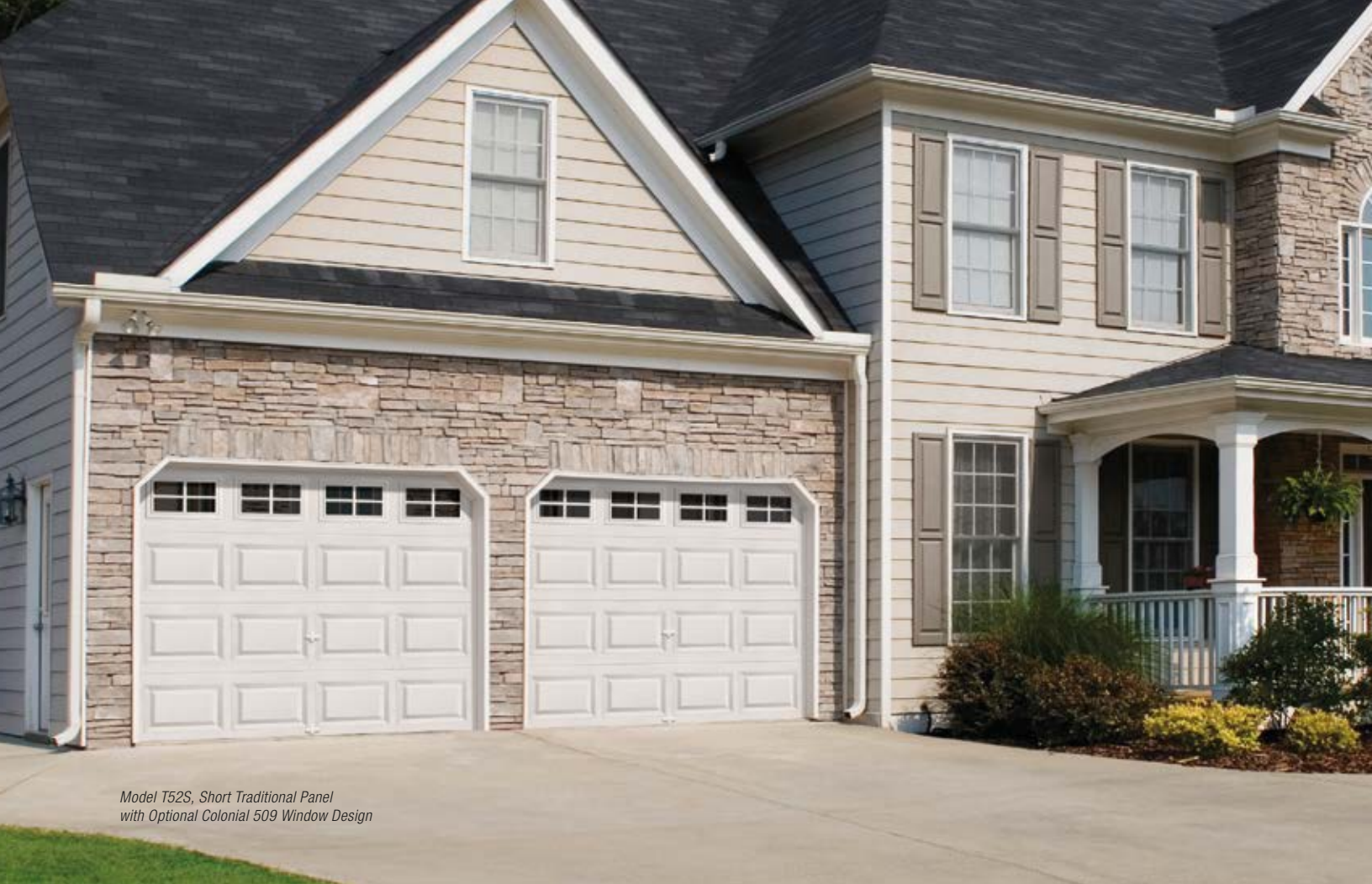
Model T52S, Short Traditional Panel with Optional Colonial 509 Window Design