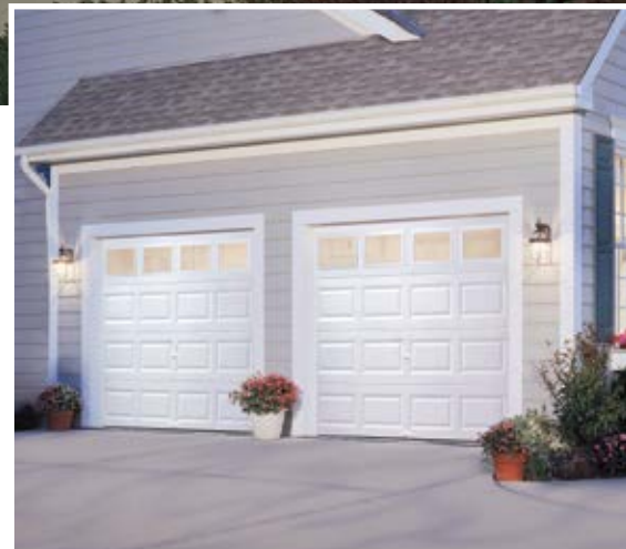
Model T42S, Short Traditional Panel with Plain Short Windows