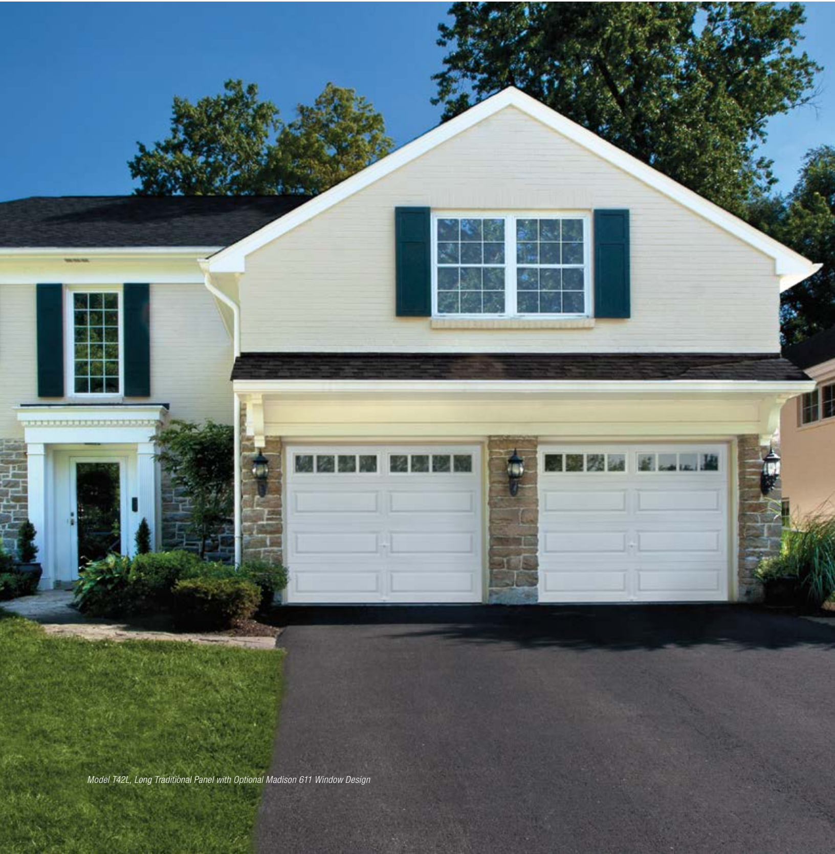
Model T42L, Long Traditional Panel with Optional Madison 611 Window Design