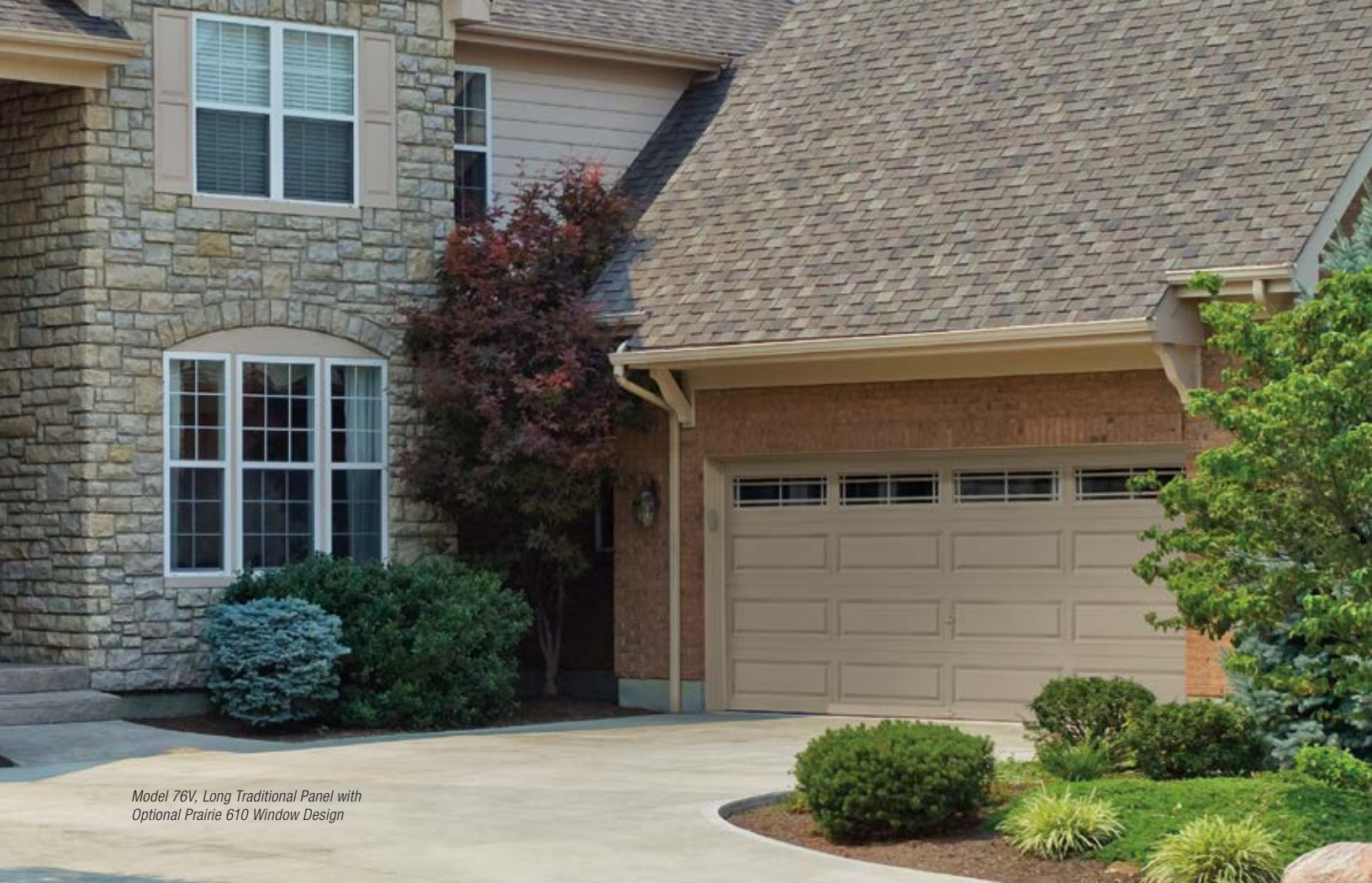
Model 76V, Long Traditional Panel with Optional Prairie 610 Window Design