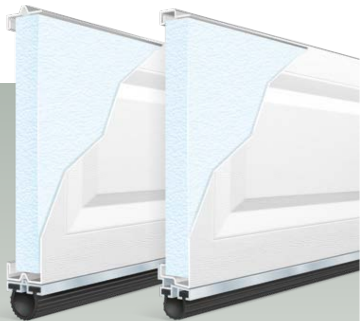
Tongue-and-Groove Section Joints

24 GAUGE STEEL T42S short panel T42L long panel