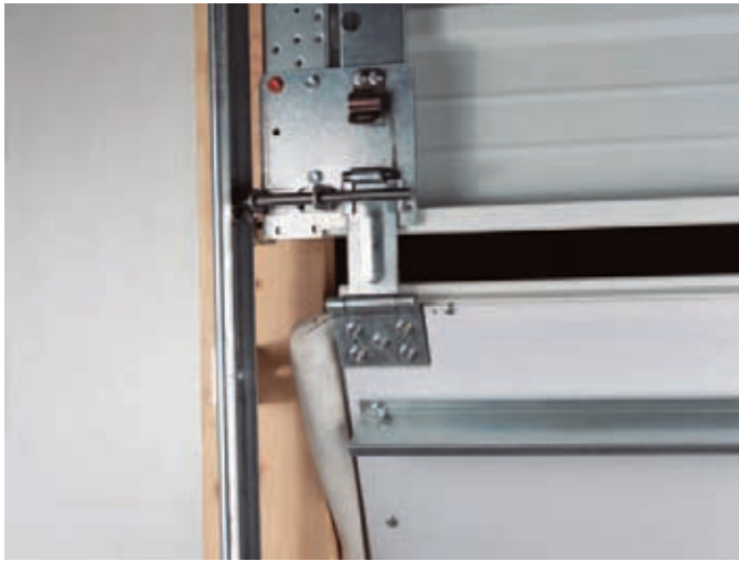
Inside View of Single Bottom Section

Clopay's break-away bottom sections will release from the track and swing up to a full 45° angle inward or outward, preventing further damage to the door. The cable attachment at the bottom of the second or third section enables the door to continue operating after being struck. The bottom sections can be snapped back into place in less than a minute. The bottom sections have a fiberglass or polycarbonate sheet on the inside of the sections to resist dents and maintain an attractive appearance. These sections are available on the 1-3/4" (44.5 mm) and 2" (50.8 mm) thick 3000 series polystyrene and polyurethane insulated doors, and on all 520 and 524 Series ribbed Steel doors.