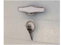
Outside keyed lock