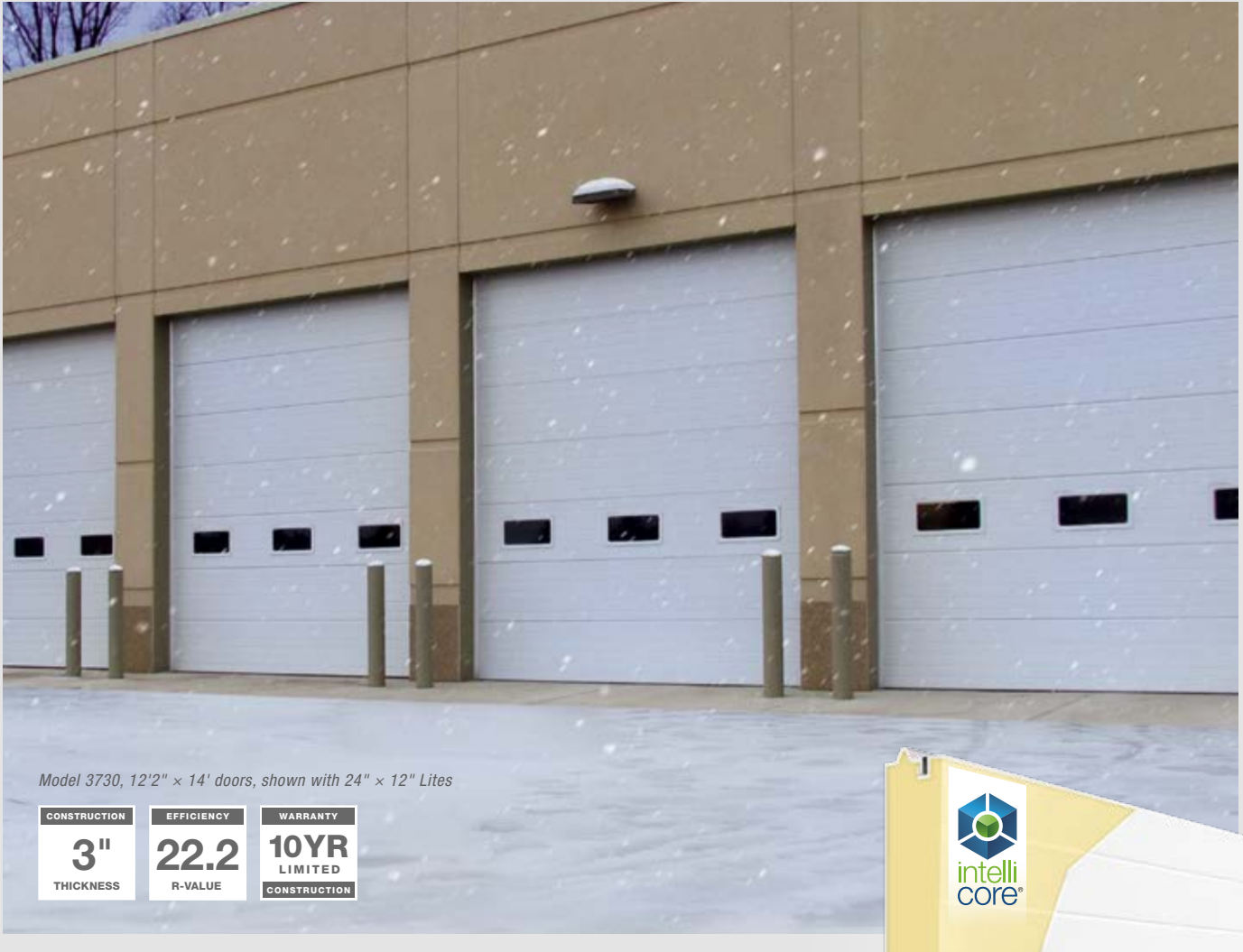
Model 3730, 12'2" x 14' doors, shown with 24" x 12" Lites