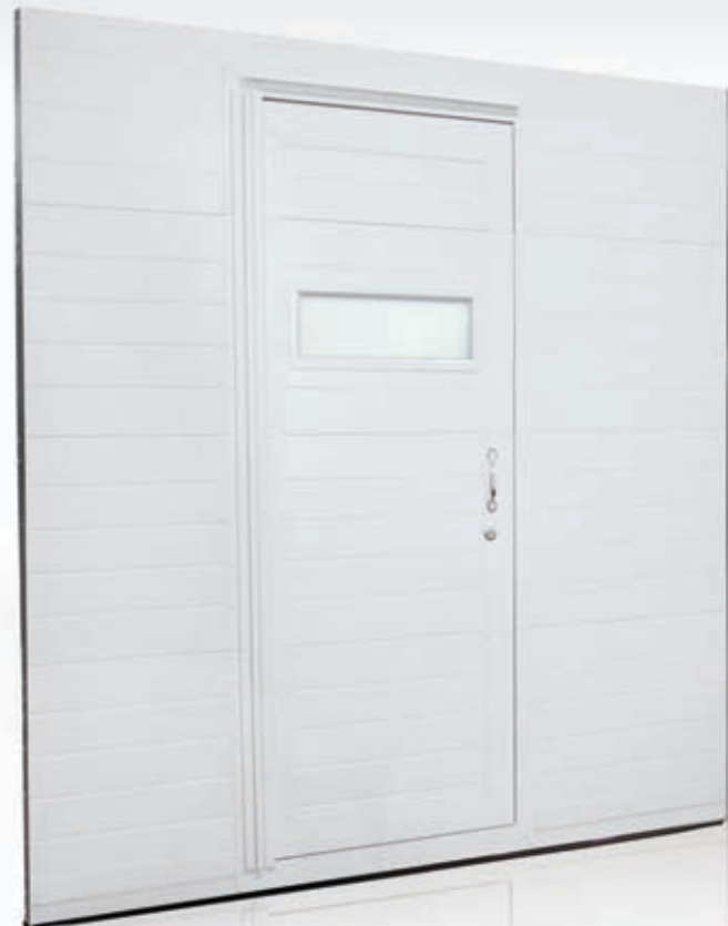
32" Wide x 6'8" High Windows Available

Minimum of 60" of high lift is required for 500 series pass doors