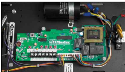
Includes the Medium-Duty Logic Board with Built-In Receiver