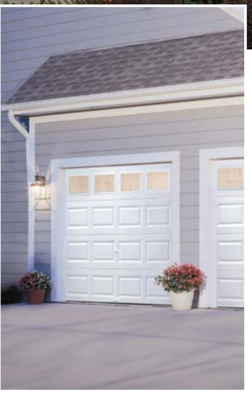
Model T42S, Short Traditional Panel with Plain Short Windows