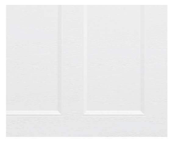
A true recessed stamp replicates the timeless look of a rail and stile built wood door.