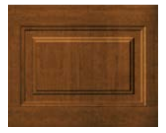
Classic Medium Finish